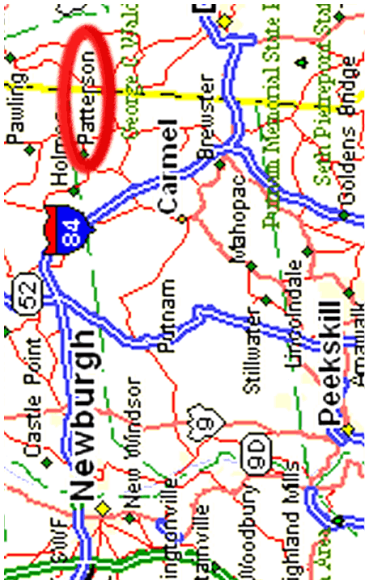
Putnam County and Vicinity

The Town of Patterson is situated in the northeast corner of Putnam County, New York. Patterson , one of Putnam's six towns, is bordered by Connecticut to the east, Dutchess County, New York to the north, the Town of Kent to the west, and the Town of Southeast to the South.